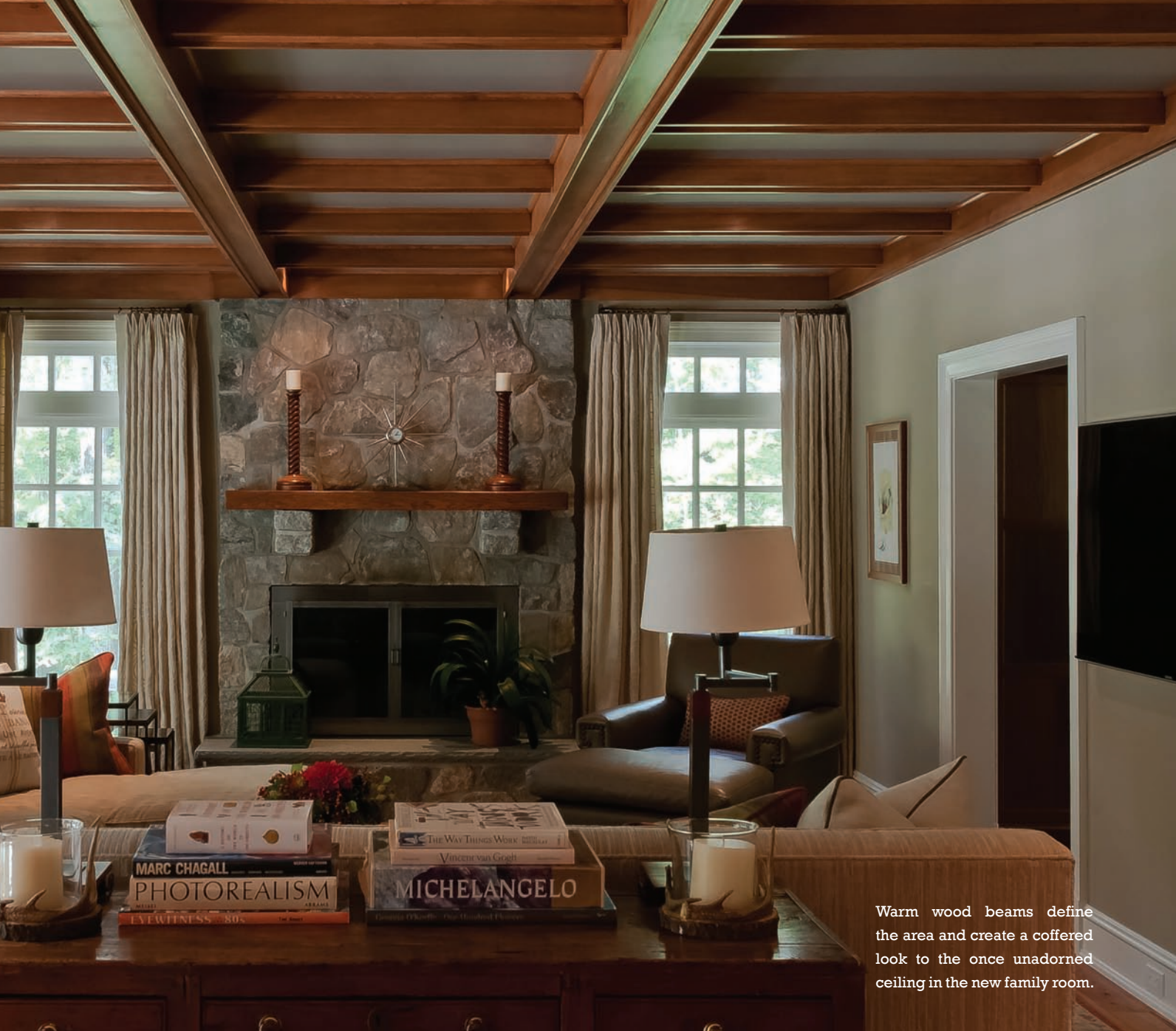
Warm wood beams define the area and create a coffered look to the once unadorned ceiling in the new family room.

faced, was addressing the proportions of the combined kitchen, breakfast and family room space.” At fifteen feet wide and fifty-five feet long, it lacked the architectural interest and gracious detailing that define the vast body of Ms. McGarry’s work. To accomplish this feat, she introduced a dividing wall between the kitchen and family room areas. A cased opening was created to maintain open “communication” between the spaces. McGarry worked in conjunction with Norwalk builder, R.J. Aley to transform the spaces.