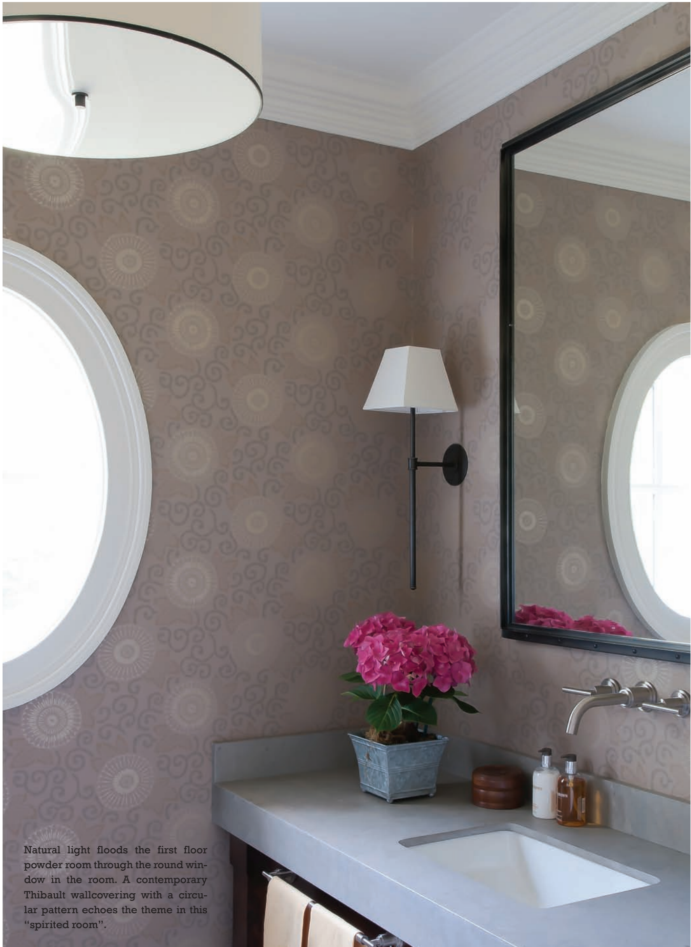
Natural light floods the first floor powder room through the round window in the room. A contemporary Thibault wallcovering with a circular pattern echoes the theme in this "spirited room".