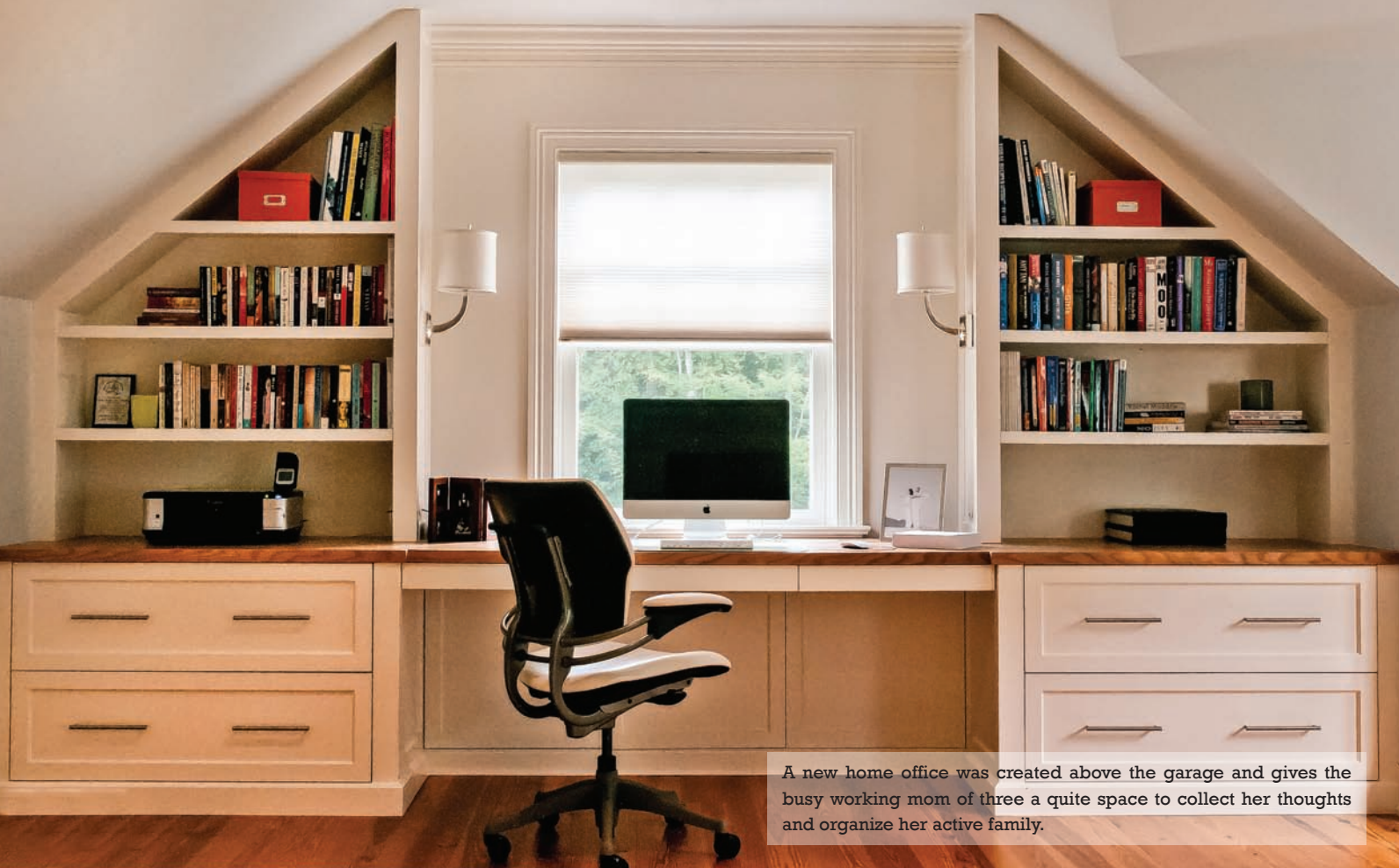
A new home office was created above the garage and gives the busy working mom of three a quite space to collect her thoughts and organize her active family.