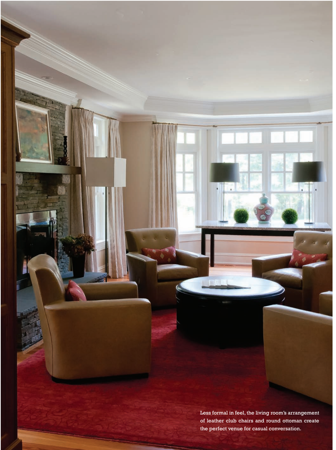
Less formal in feel, the living room's arrangement of leather club chairs and round ottoman create the perfect venue for casual conversation.