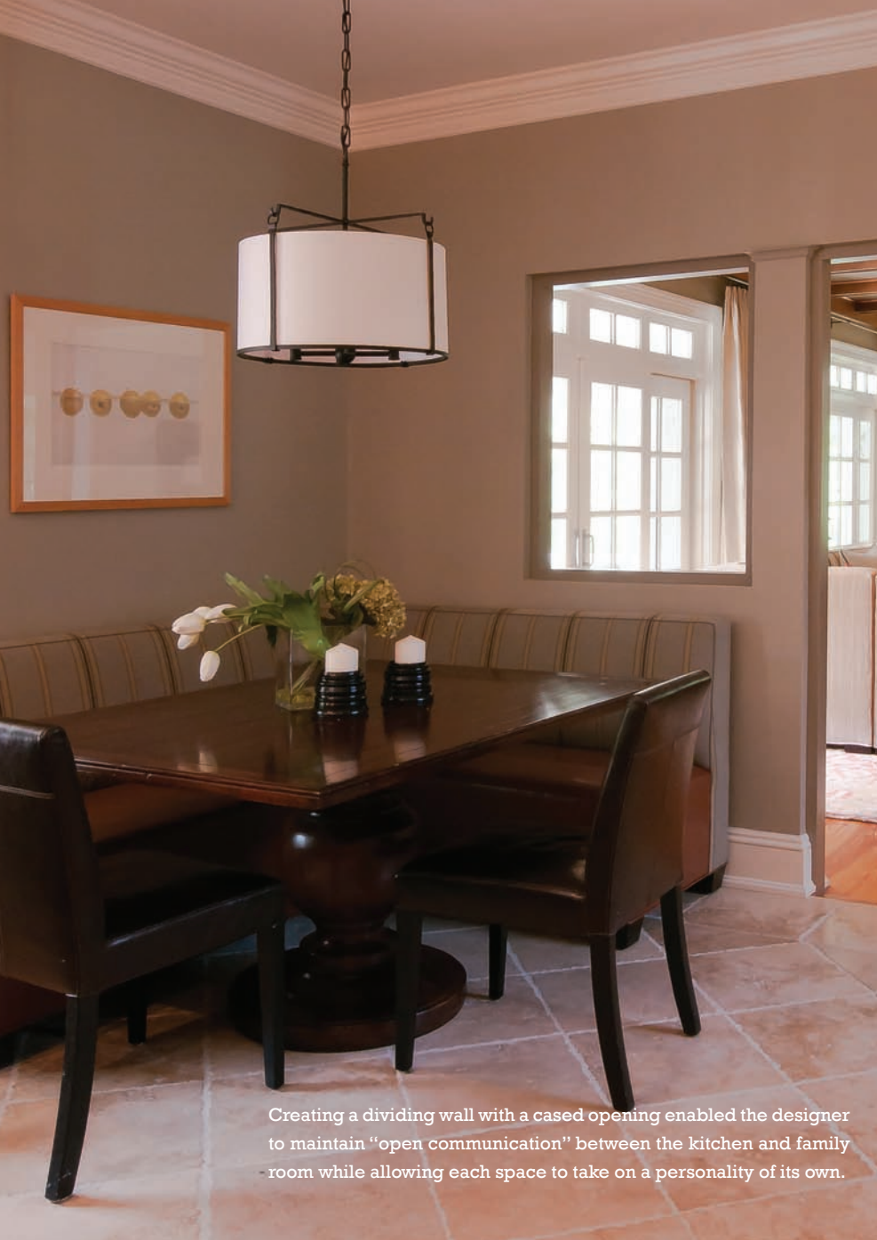
Creating a dividing wall with a cased opening enabled the designer to maintain “open communication” between the kitchen and family room while allowing each space to take on a personality of its own.